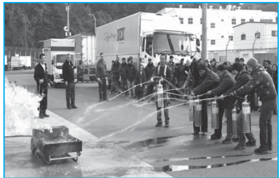
The NEX Distribution Center in Yokosuka, Japan, worked with the Yokosuka Base fire department to conduct fire extinguisher training. The Distribution Center conducted an evacuation drill and 48 associates volunteered to learn how to properly use fire extinguishers.

For additional information on smoke alarms and fire safety, go to www.nfpa.org .