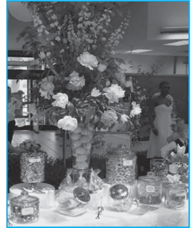
Customers could sample candy at the candy bar.